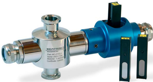
Integrated NIST validation accessory

Standard features include 16 linearization tables for multiple product switching, remote zeroing, automatic cell cleaning cycle and signal filtering. A built-in graphical internet based interface allows remote operation, calibration, validation and data trending using a standard web browser.