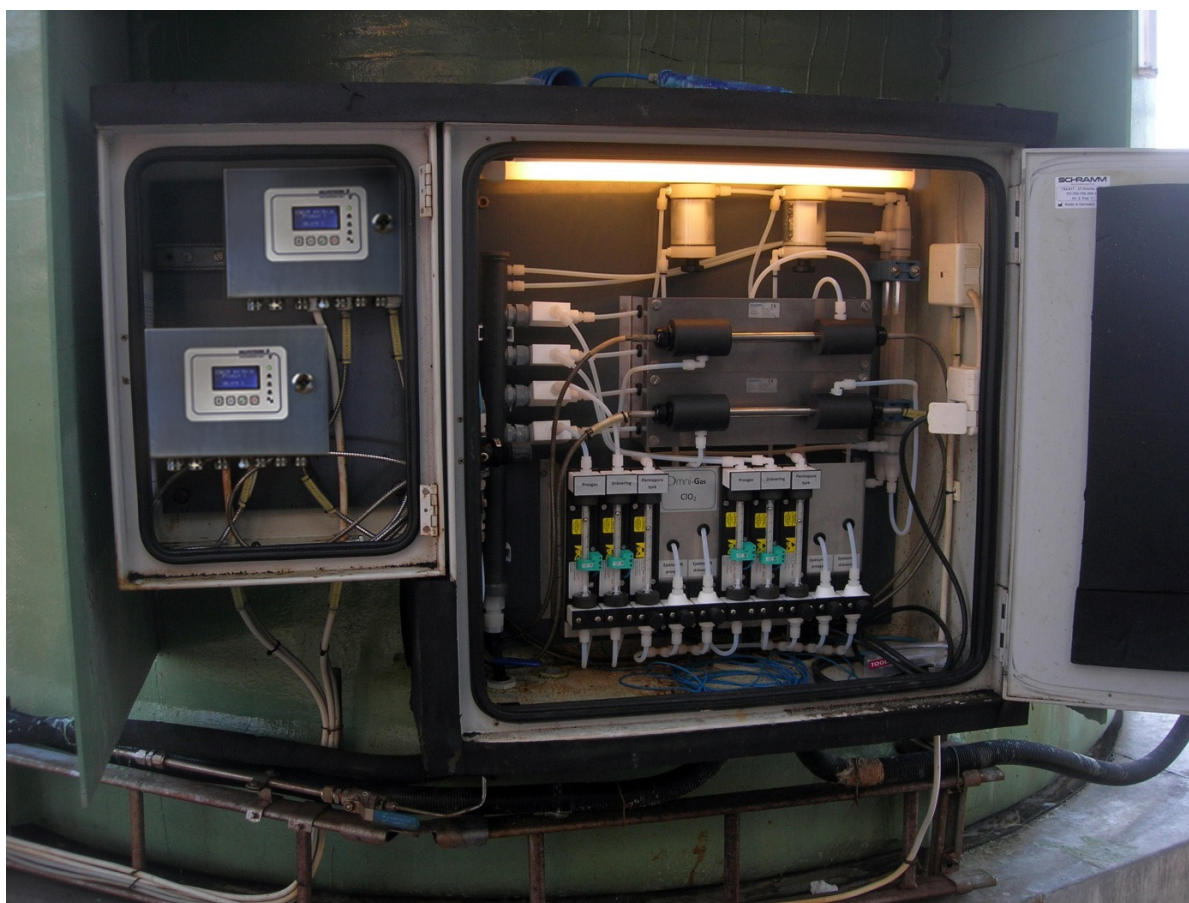
Kemtrak DCP007 process photometer with 200mm optical path length PTFE 25% C - titanium measurement cell and extractive gas sampling system installed at the outlet