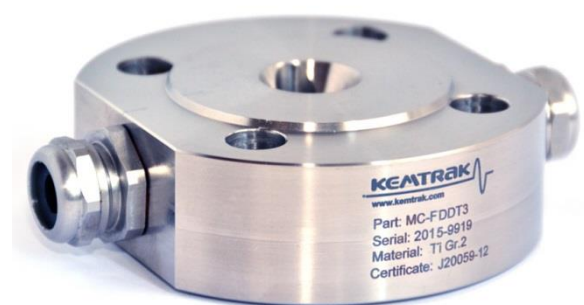
Kemtrak DCP007 process photometer DIN DN25 Titanium Gr 2 measurement cell

Due to the aggressive nature of chlorine dioxide, all wetted parts are manufactured from corrosion resistant materials, such as titanium Gr 2 and sapphire. The recommended measurement cell for this application is a DIN DN25 or ANSI 1" 150lb installed in a bypass line where water is available to zero the instrument.